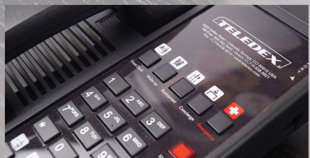
Classic K-style handset.