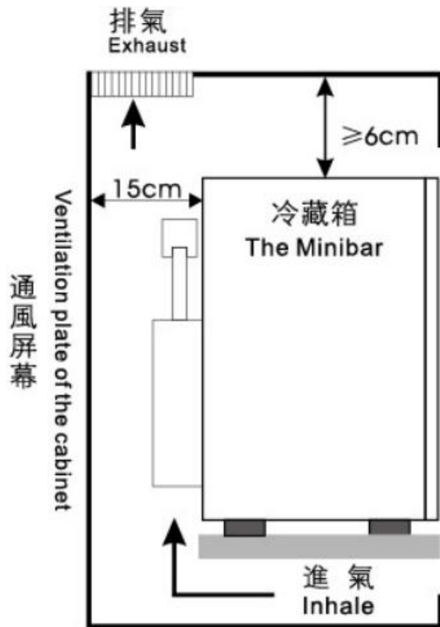
無門體櫃子 Cabinet without door