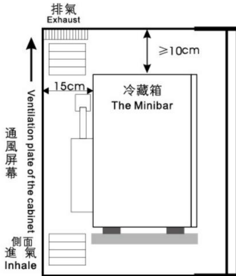
帶門體櫃子 Cabinet with door